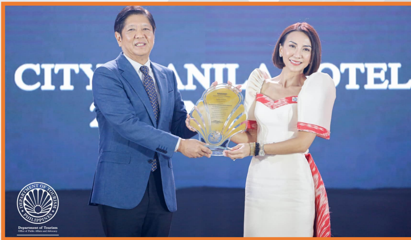
Ferdinand R. Marcos Jr. Philippine President with Maria Cristina C. Frasco Department of Tourism Secretary during the DOT’s 50th Anniversary.

In an effort to revitalize its campaign to showcase the diverse beauty and captivating allure of the Philippines, the Department of Tourism (DOT) unveiled its new slogan, "Love the Philippines", replacing the 11-year-old slogan “It’s more fun in the Philippines,” during its 50 th Anniversary celebration held at Manila Hotel on June 27, 2023. The DOT event was graced by none other than President Ferdinand Romualdez Marcos, Jr., and other government officials, tourism industry stakeholders and representatives of other DOT attached agencies, including the Philippine Retirement Authority (PRA).